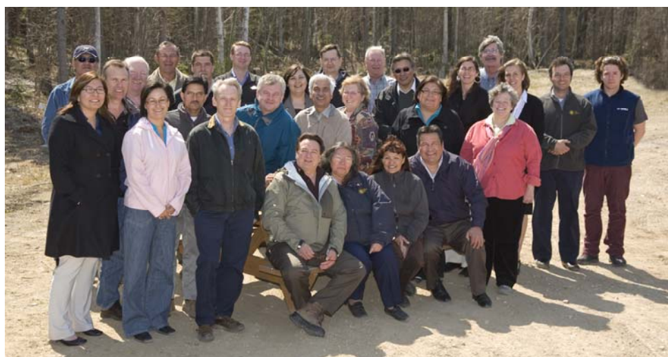
The Board Forum Attendants at the Hay Reserve meeting on June 3, 2009.