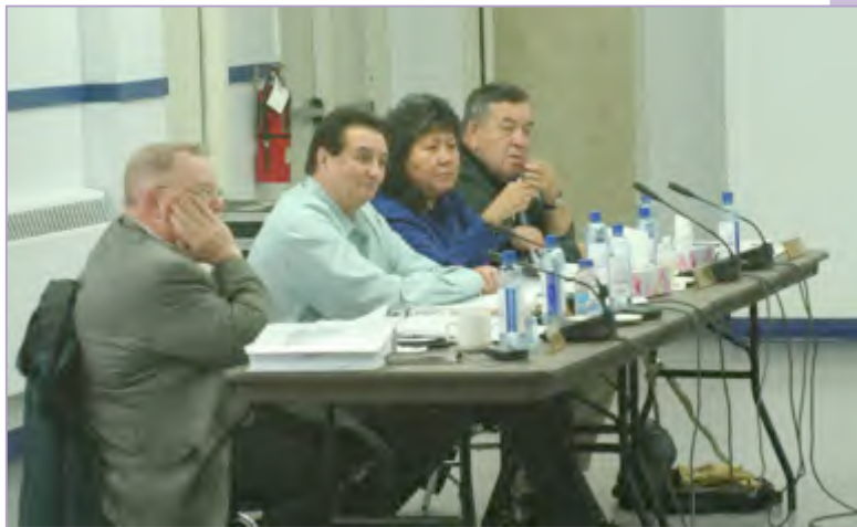
Tundra Mine Public Hearing, November 2009. Yellowknife

The Board is currently in a phase in which its project files present complex challenges and have put it in the public spotlight. It has been dealing with issues concerning: