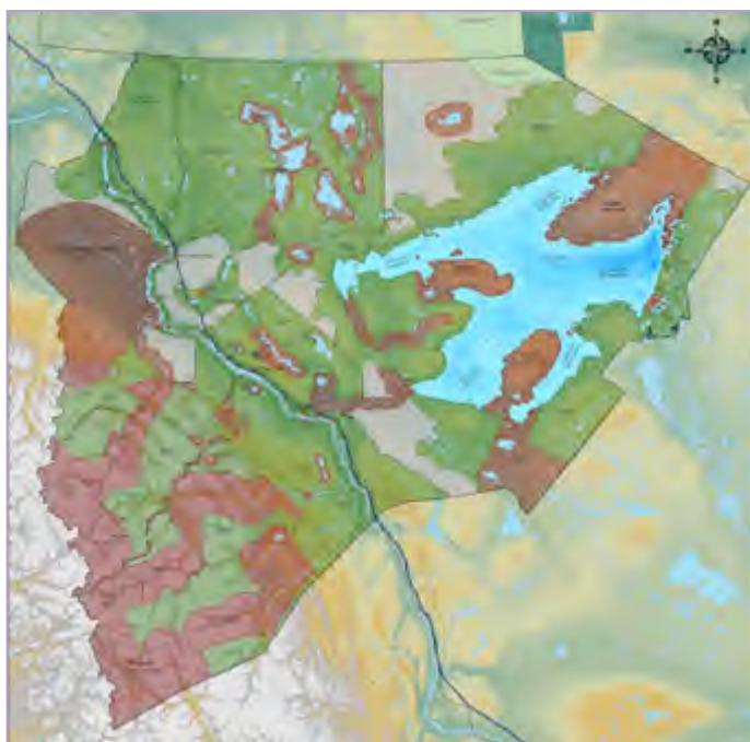
Sahtu Land Use Plan: Draft 1 – February 16, 2007

The PAS has a five year plan that is coming to an end, so a new one is underway. This is an action plan for the Mackenzie Valley. The new plan builds on this but there are other links that need to be made or strengthened with other boards. The Canadian Wildlife Services have committed to establishing six new wildlife management areas and though the GNWT have not yet sponsored any, it is reviewing proposals for six areas. There are also some “orphan sites” where the PAS needs to determine who is responsible for sponsoring those sites – this is where the boards are being looked to.